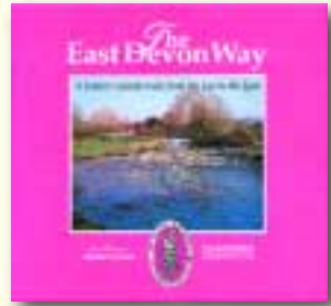
East Devon Way official guide book