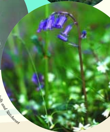
Bluebell and Stitchwort