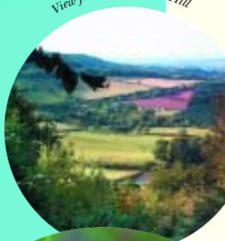
View from Fire Beacon Hill