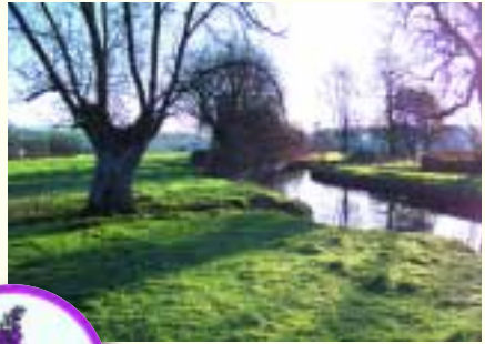
River Coly near Colyton

For more information about the East Devon Way contact East Devon AONB Email: aonb@eastdevon.gov.uk Tel: 01395 517557