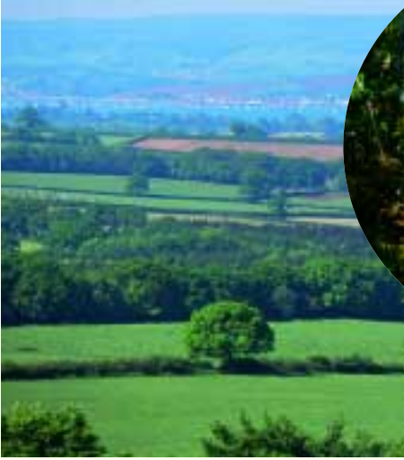
View towards the river Exe and Lympstone from Woodbury

The East Devon Way links together footpaths, bridleways and quiet country lanes to create a route that winds inland through gently undulating country to link Exmouth and Lyme Regis.