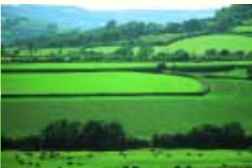
Countryside near Colyton